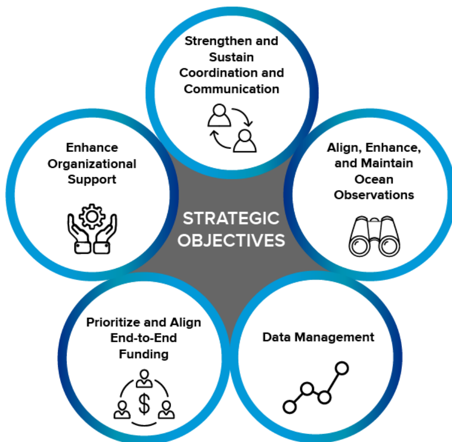
Figure 2. Integrating Ocean Observations Strategic Objectives

These strategic objectives will be pursued in partnership with NOAA's external partners to ensure that every person and business in our Nation will benefit from enhanced Earth system prediction through improved and more accurate weather-water-climate-ocean data, tools, and information.